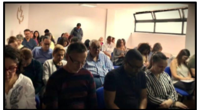
Sunday morning-it's a full house! In September we plan to go to two services.

telling our church to pray for God to provide a building for us to rent. The very week we returned to Portugal, we found our church building. Two weeks later we had the keys! Without going into all the details, this was truly God's doing! He passed us through all the red tape and bureaucracy so common here in Portugal. It is a beautiful place, with a fellowship area and a Sunday school room for children.