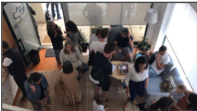
Fellowship time after Sunday Service